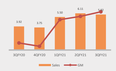
PAT (Rs'mn) vs Net Margin